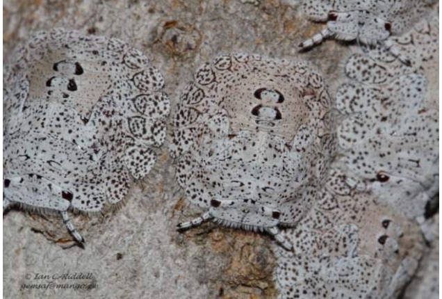
Libyaspis wahlbergi pill bug nymphs

Sunbirds and Miombo Double-collared Sunbirds and other odd-bods like Blue Waxbills. Perhaps, like us, the nectar was slow to flow at that time of the morning. Crossing down towards the tall Acrocarpus near the houses I hoped to spot the Western Violetbacked Sunbirds but no luck, the tree wasn't yet in flower like some are in Harare, and it was fairly bare though our raptors were taking sticks from near the top. The tree didn't look too healthy - I wonder if it is on the way out!