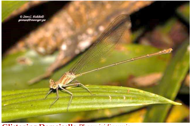
Glistening Demoiselle Phaon iridipennis

On the Tree Society visit to Bryden Country School, Chegutu (pentad 1805_3010), on 16th July I had a brief glimpse of a male Western Violet-backed Sunbird in an Acrocarpus tree in the grounds, an unexpected range extension. It turns out that Variable Sunbirds are also 'new' to that area, as are Black-throated Wattle-eyes, which were on the Umfuli River. The latter are less surprising as Ferdi and Tracey Couto have them from further 'upstream' in pentad 1805_3020, i.e. Pamuzinda. Possibly they have made incursions up the Sanyati from the Zambezi Valley. I was sure I heard Willow Warbler calling on the Umfuli but couldn't confirm it with a sighting! Ian Riddell