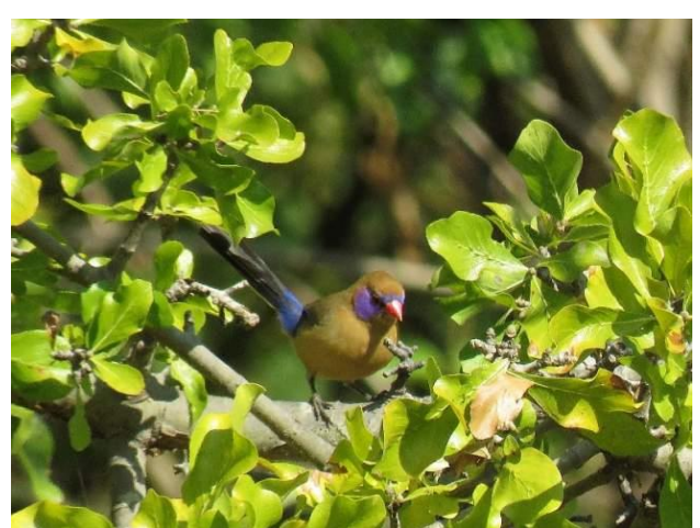
Violet-eared Waxbill at Charama. Ruth Baldwin-Paice

There are 5 ponds with various water depths with grasses, reeds and dye sediment in the shallower areas. A worthwhile trip as the following were feeding or resting. 12 Kittlitz's Plovers, 10 Blacksmith Lapwings, 17 Threebanded Plovers, 6 Black-winged Stilts, 58 Cattle Egrets, 5 African Sacred Ibis, 9 Red-billed Teal, 6 Little Grebes, adult and 1 juvenile Grey Heron, 1 African Fish-eagle.