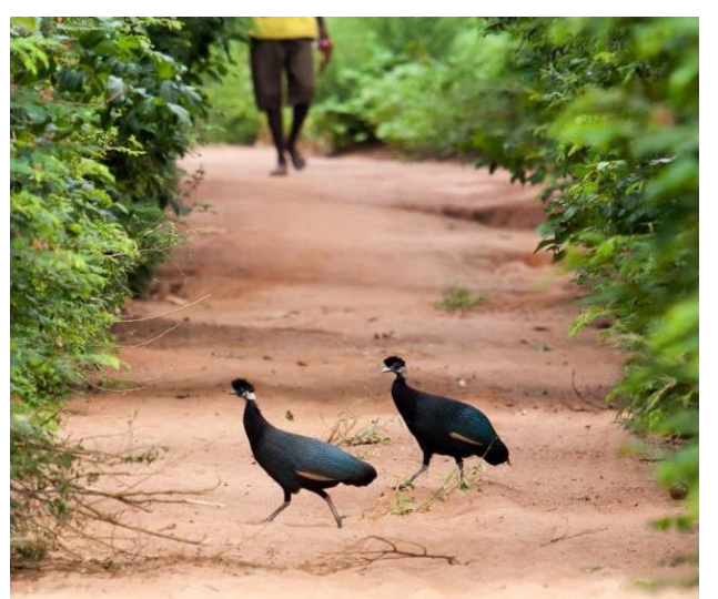
Southern Crested Guineafowl at Catapú, Celesta von Chamier

blue face with red throat; hood tying up under chin, with brownish-white patch at rear vs hood descending as short tube down front of neck; broad blackish-chestnut vs black collar; red vs dark eye; different voice, being as given above vs "a crack followed by a distinct rapid piping krk pu-pu-pu-pu-pu". Described races (Zambezi region) and symonsi lividicollis (KwaZulu-Natal) are regarded as synonyms of suahelica nominate edouardi; (coastal S Tanzania) is considered inseparable from barbata.