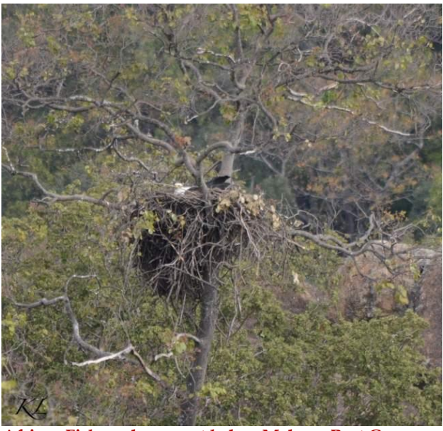
African Fish-eagle on nest below Maleme Rest Camp