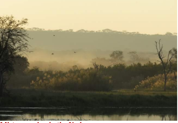
Misty morning in the Kadoma area

Some elephants from the Hartley Safari area were moving around the area – two different herds, the larger one numbering around 13, with young. There was plenty evidence of their presence at the small dam we visited. This was the same dam where we saw the two White Storks and three Hamerkops.