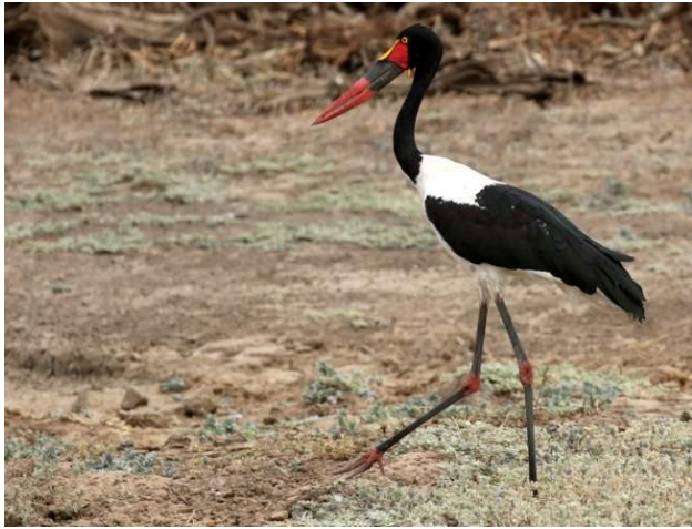
Female Saddle-billed Stork with wattles